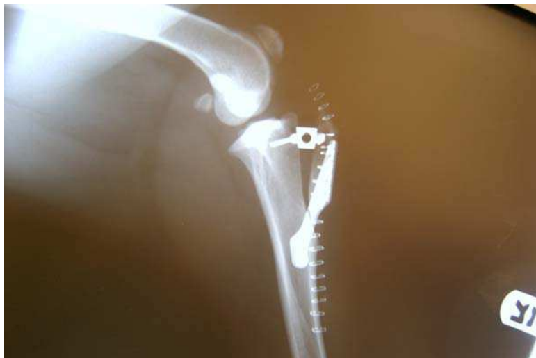
A postoperative x-ray of a tibial tuberosity advancement

The 8-week postoperative follow up radiograph is important. We are evaluating the leg for proper long-term alignment of the implants, failures, and to assure adequate healing of the osteotomy site. Once healed, a regimen of increased exercise as tolerated by the dog will result in a quick recovery to full use of the limb. Generally, this is about another 1-2 months.